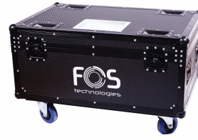
FOS Case Cyclone PRO/F-6 GO

Flight case with wheels for 4 pcs Cyclone PRO or F