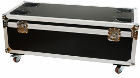
FOS Case Led Follow Spot 350

Flight case with wheels for Led Follow Spot 350.